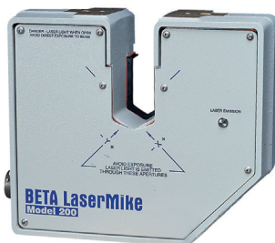
Model 200 2-axis diameter gauge