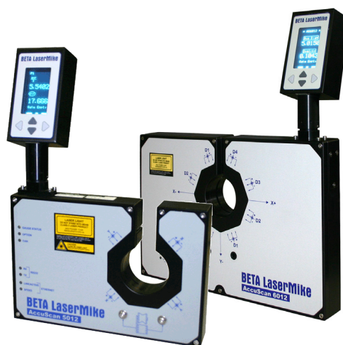
AccuScan 6012 4-axis & 5000 Series 2-axis diameter gauges